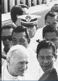
Pope & Marcos