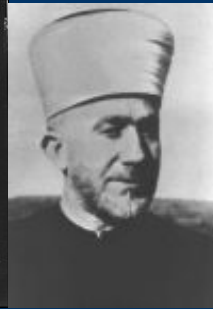
Haj Amin Al-Husseini