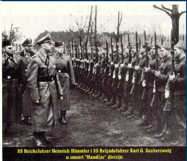
SS Reichsfuhrer Heinrich Himmler i SS Brigadefuhrer Karl G. Sauberzweig u smotri "Handzar" divizije

Haj Amin Al Husseini (Yasser Arafat's Uncle) inspecting the Bosnian-Muslim Hanjar / Handzar Division recruited into the JESUITS NAZI SS. Heinrich Himmler NAZI SS Chief inspecting the Bosnian-Muslim SS Unit. Haj Amin-Al Husseini was Yasser Arafat's Uncle, then Jesuit Fr. Himmler was the uncle of the SS NAZI Chief Heinrich Himmler.