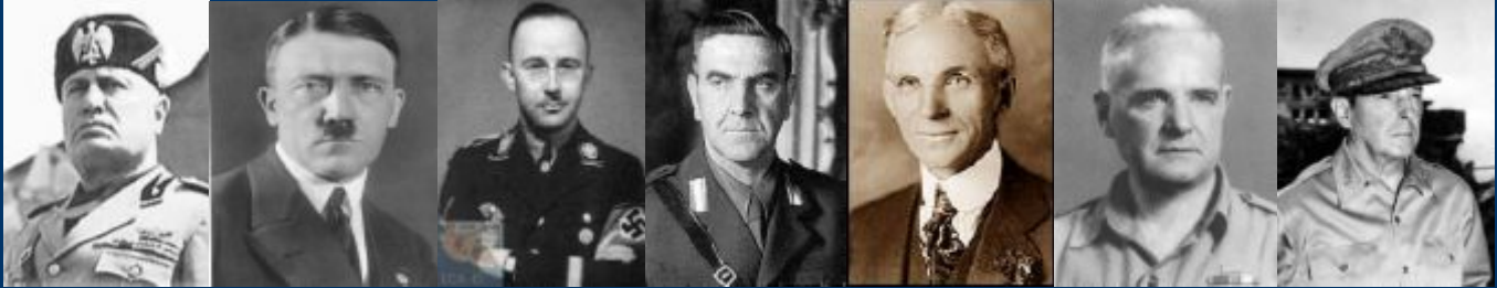
Benito Mussolini Adolph Hitler Heinrich Himmler Ante Pavelic Henry Ford Wild Bill Donovan Gen. McArthur