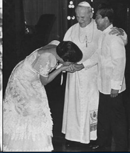
Pope, Imelda & Marcos