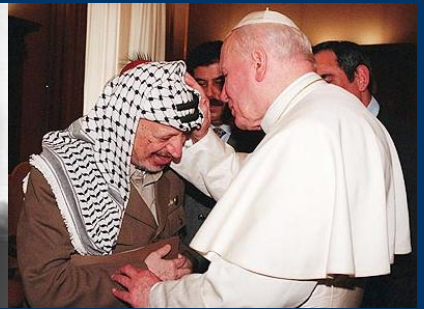
Yasser Arafat & Pope John Paul II

Admiral Yamamoto of the Imperial Japanese Navy who led the attack of U.S. Pacific Fleet in Pear Harbor was the only Japanese admiral who was a Roman Catholic. Ferdinand E. Marcos was a Papal Knight Of Malta, Ferdinand E. Marcos received Grand Cross Of Merit of the Sovereign Military Order Of Malta can be found on Marcos curriculum vitae. Haj. Amin Al-Husseini was the Grand Mufti Of Jerusalem. Bosnian-Muslim troops - a unit of the "Hanjar (Saber) Division" of the Waffen SS which he personally recruited for Hitler and of course for the NAZI SS created by the Jesuit Order.