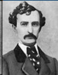
John Wilkes Booth