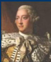
King George III