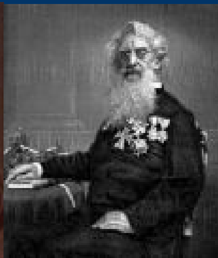
Two Men Of Science And Mathematics BLAISE PASCAL & SAMUEL MORSE

Are two credible witnesses that the Society Of Jesus is the most devious religious entities in this world. The Jesuit Order "REGIMINI MILITANTIS" was created as Shock Troops of the Pope - Military Religious Order "FATHER GENERAL"