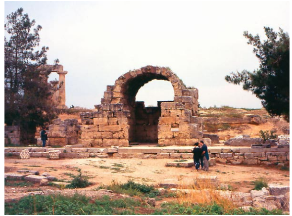
Sacred Fountain in Agora