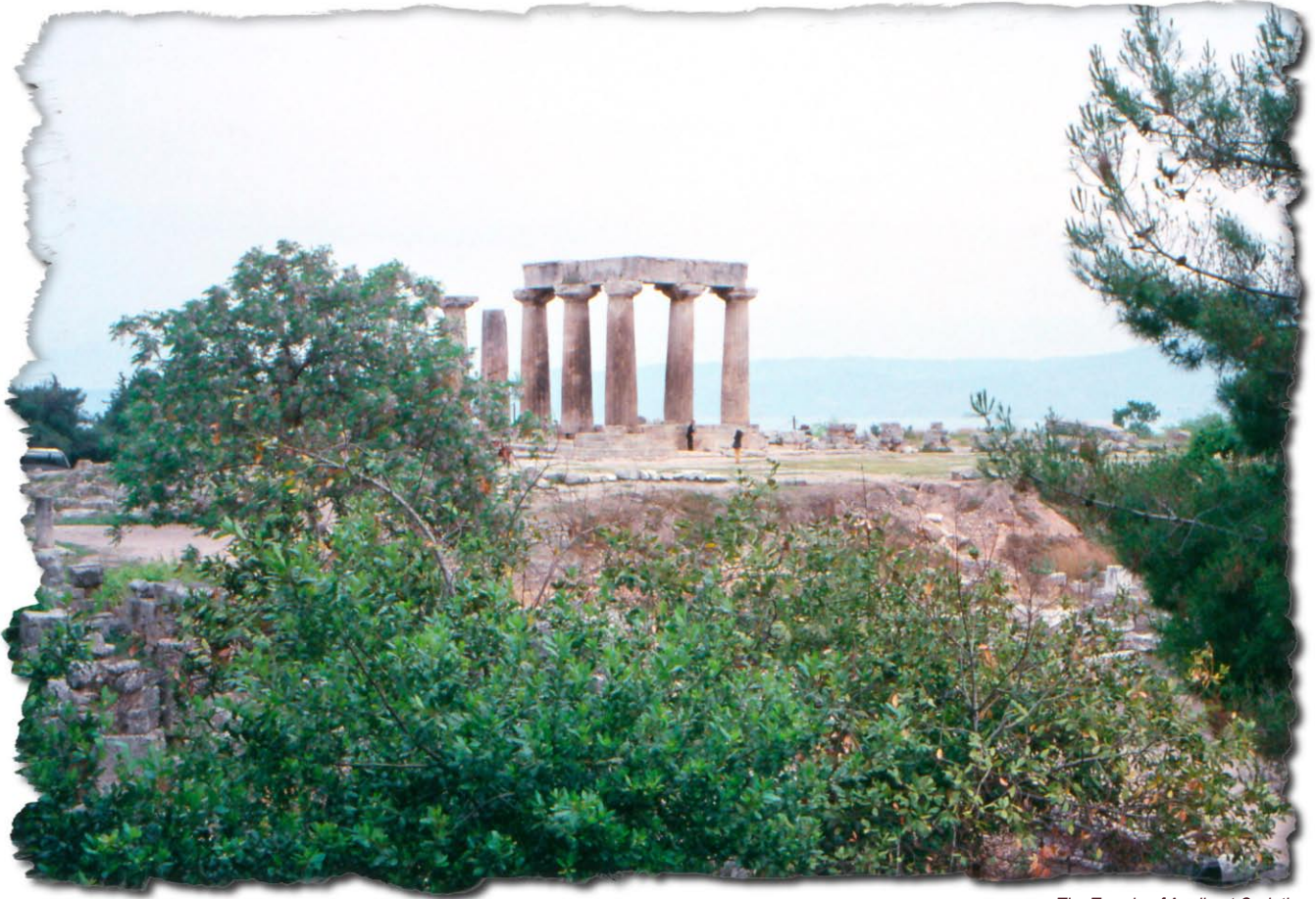
The Temple of Apollo at Corinth

“To the church of God which is at Corinth, to those who are sanctified in Christ Jesus, called to be saints, with all who in every place call on the name of Jesus Christ our Lord, both theirs and ours: grace to you and peace from God our Father and the Lord Jesus Christ” (1 Corinthians 1:2-3)