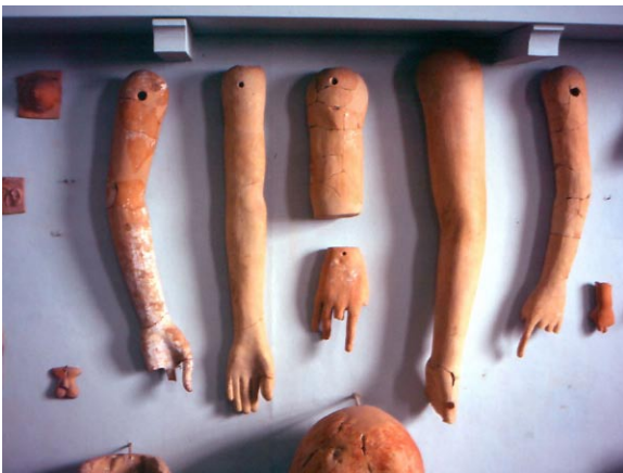
Ex Votos from Sanctuary of Asklepios