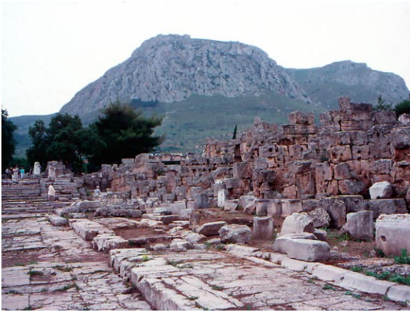
City Streets and Acrocorinth