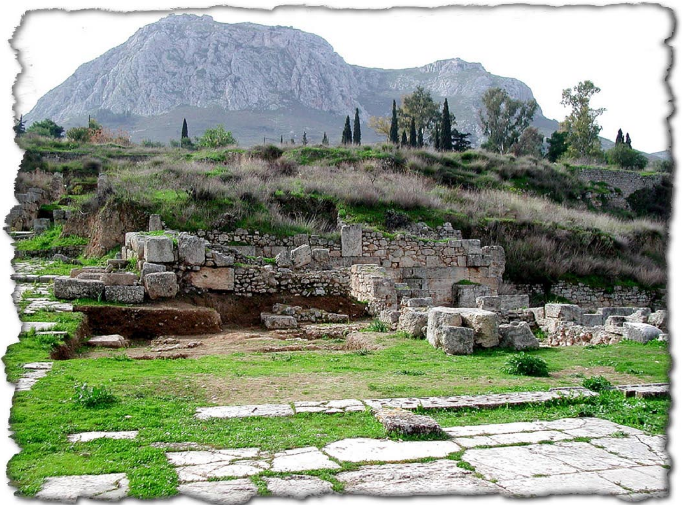
Area of the Erastus Inscription

“Paul, an apostle of Jesus Christ by the will of God, and Timothy our brother, to the church of God which is at Corinth, with all the saints who are in all Achaia...” (2 Corinthians 1:1)